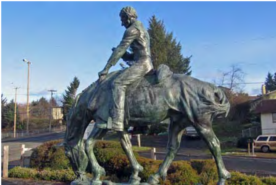
Lincoln Statue in Lincoln City, Oregon

As the state population began to grow after the Civil War, town and county names reflect immigration patterns from both the northeast and southeast as well as Northern and Southern heroes. Cities and towns named after New England cities like Portland, Salem and Newport are balanced by those named after southern communities like Nashville, Sumter (named by some South Carolina immigrants after the fort) and McMinnville where I went to college which is named after a town in Tennessee. Counties named in honor of Lincoln, Grant, Sherman, Crook and Baker are balanced by counties named after Southern heroes Polk, Lane and Douglas. Fort Stevens where I worked as the first historian was shelled by the Japanese in World War II. It was named in honor of Union General Isaac Stevens killed at Chantilly. Several of the Japanese shells landed near Battery Russell named after Union General David Russell killed at Third Winchester. The big annual celebration in one Oregon community is called Phil Sheridan Days.