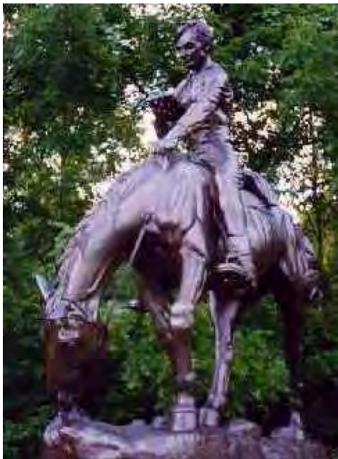
Lincoln Statue in New Salem State Park, Illinois

displayed over 40 animals, mostly horses. She became one of America's foremost animal sculptors, known for her wild and domestic animal sculpture as well as heroic monuments. This is reflected in her equestrian statue of Lincoln on the Oregon coast. It depicts Lincoln on horseback reading a book as he often did while studying law. A duplicate cast of the 14 foot statue stands in New Salem State Park where Lincoln lived as a young adult in Illinois and in Salzburg, Austria.